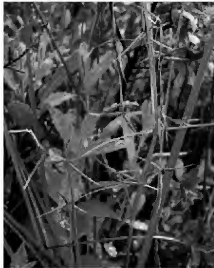
Figure 1. Horned beakrush ( Rhynchospora inundata ) at Sandy Pond. [Ed. Note—Photographs by the author unless otherwise noted. Common and scientific names of species seen or sought are listed, beginning on page 21.]